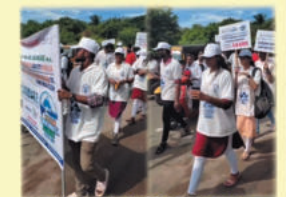
SWACHH BHARAT CLUB AND UNNAT BHARAT ABHIYAN