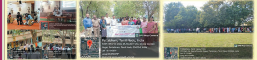
YRC - FIRST AID TRAINING AND DISASTER MANAGEMENT