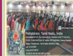
YOGA AND MEDITATION