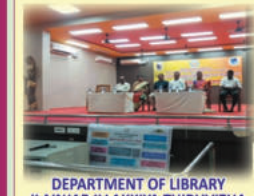
DEPARTMENT OF LIBRARY ILAINJIR ILLAKKIYA THIRUVIZHA