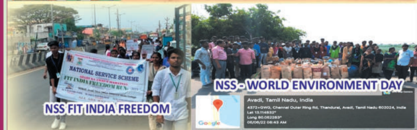
NSS FIT INDIA FREEDOM