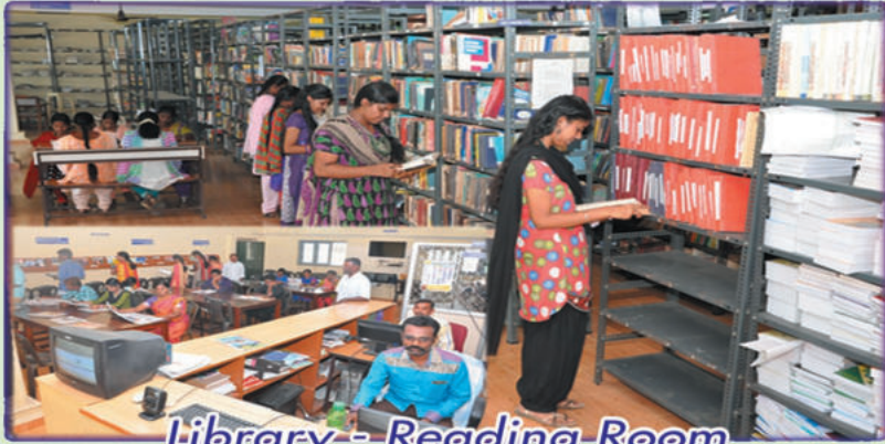
Library - Reading Room